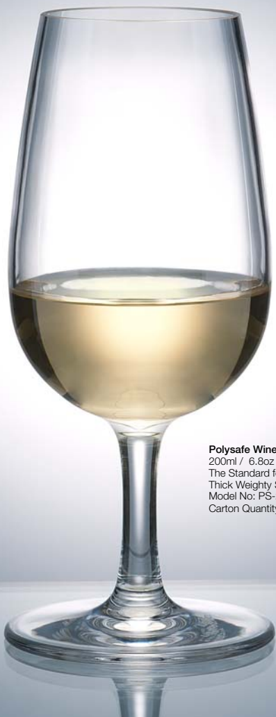
Polysafe Wine Taster 200ml / 6.8oz Capacity The Standard for Wine Tasting Thick Weighty Stem Model No: PS-28 Carton Quantity: 24