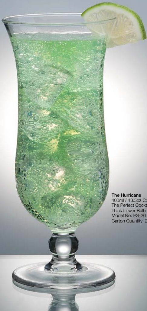
The Hurricane 400ml / 13.5oz Capacity The Perfect Cocktail Glass Thick Lower Bulb Model No: PS-26 Carton Quantity: 24