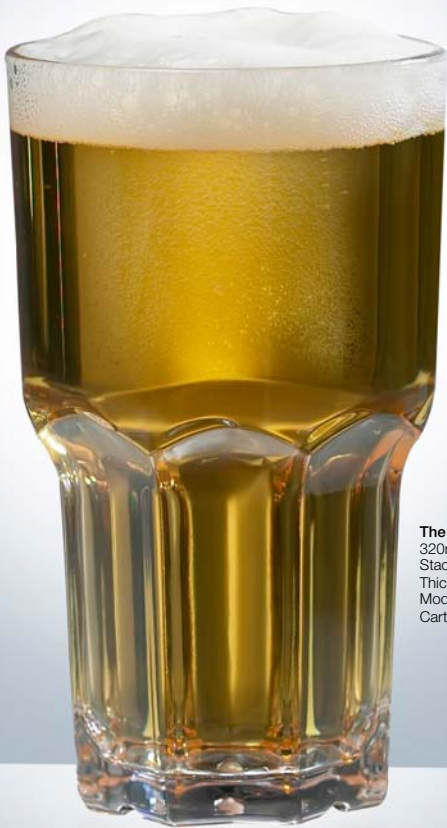
The Batida 320mL 320ml / 10.8oz Capacity Stackable Thick Heavy Base Model No: PS-22 Carton Quantity: 24