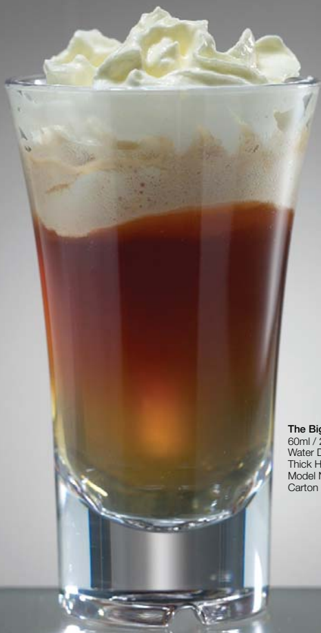
The Big Shot 60ml / 2oz Capacity Water Drains Off Base Thick Heavy Base Model No: PS-15 Carton Quantity: 48