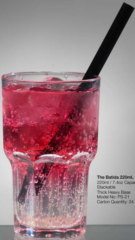
The Batida 220mL 220ml / 7.4oz Capacity Stackable Thick Heavy Base Model No: PS-21 Carton Quantity: 24