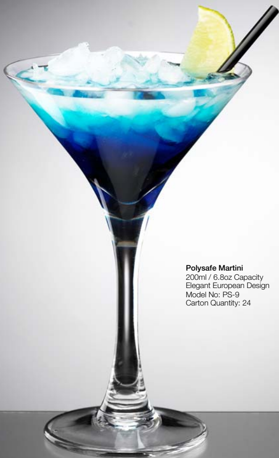
Polysafe Martini 200ml / 6.8oz Capacity Elegant European Design Model No: PS-9 Carton Quantity: 24