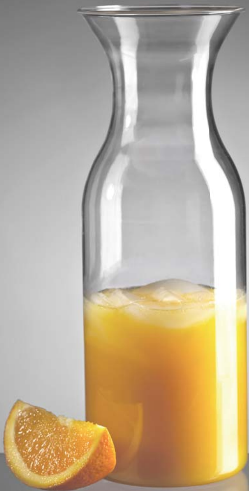
The Carafe 1Ltr / 33.8oz Capacity Multipurpose & Practical Model No: PS-25 Carton Quantity: 12