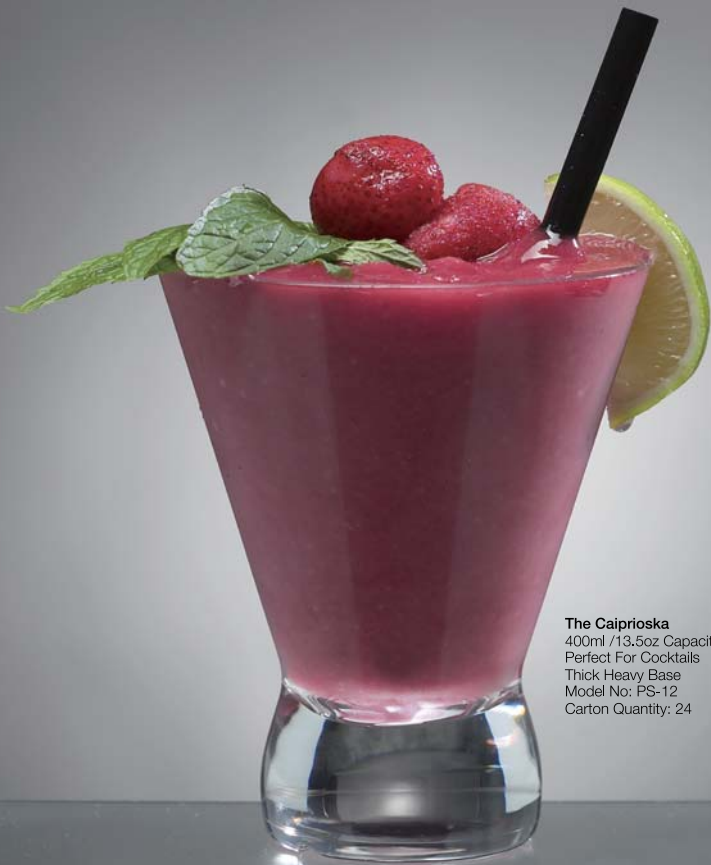
The Caipiroska 400ml / 13.5oz Capacity Perfect For Cocktails Thick Heavy Base Model No: PS-12 Carton Quantity: 24