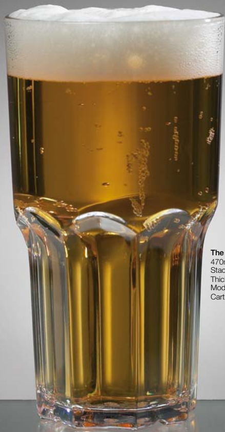
The Batida 470mL 470ml / 15.9oz Capacity Stackable Thick Heavy Base Model No: PS-23 Carton Quantity: 24